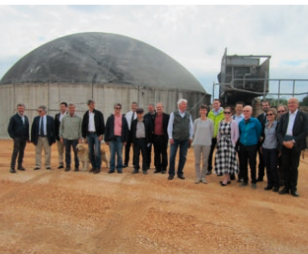
ExCo77 Study Tour Group at Bruni Enrico e Aldo Società Agricola farm

Following the ExCo77 meeting a group of eighteen IEA Bioenergy attendees participated in the study tour to the Bruni Enrico e Aldo Società Agricola farm to the north of Rome. The farm has 1,000 head of cattle and produces significant volumes of manure. The economic conditions for the farm were challenging prior to the development of the anaerobic digester. The unit was built at a cost of €1.7 million and commenced operation in 2009. It began with a nominal electrical power capacity of 250 kW e , which was subsequently increased to its current 750 kW e .