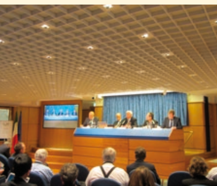
Opening session of ExCo77 workshop

The scope of this one-year project ( http://task41project7.ieabioenergy.com/ ) covers heating, cooling, fuels, electricity and chemicals. State-of-the-art reports will be published in July and the final project report will be launched at a seminar in Helsinki in November 2016.