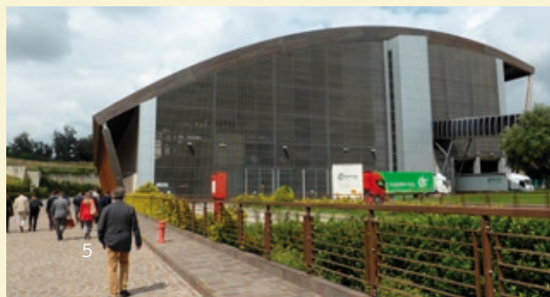
Malagrotta Waste Recovery Plant

The workshop also included a guided tour of the waste recovery plant (2 MBT lines and a gasifier that has been closed down). The plant has a separate walkway around the MBT accompanied by informational displays to facilitate visitors.