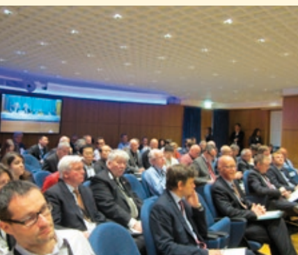
Delegates at ExCo77 workshop