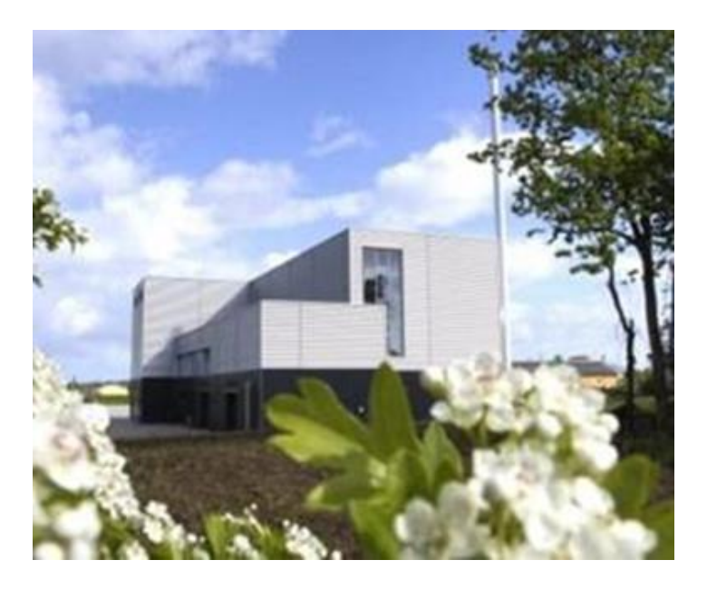
9 MW Dall Energy biomass plant in Sønderborg