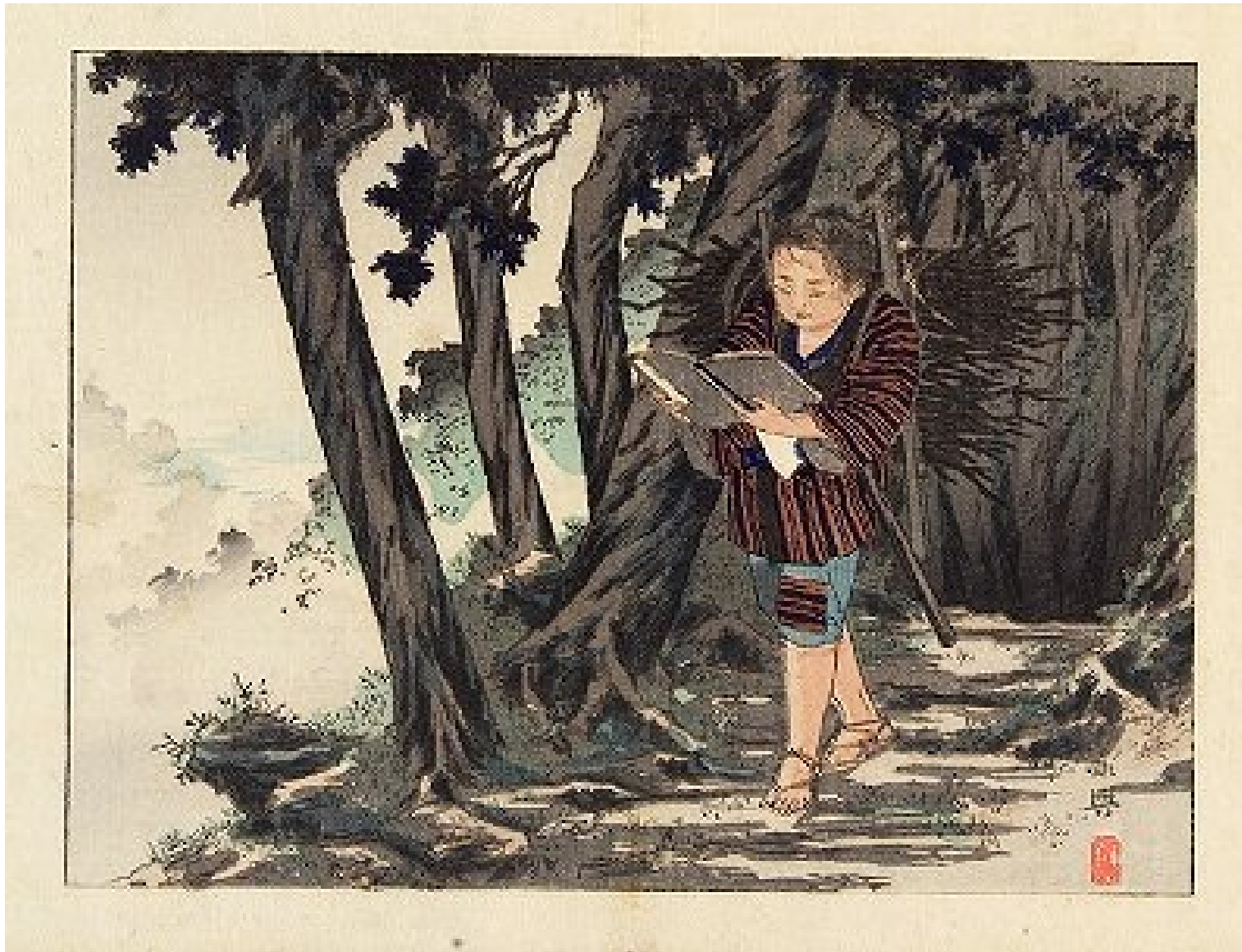
Kinjirou Ninomiya (1787-1856)