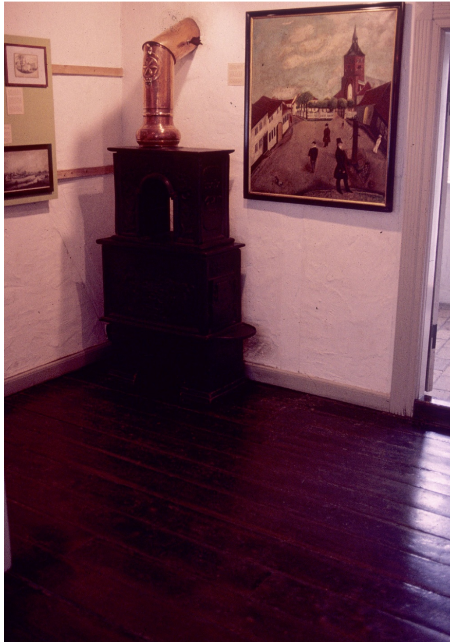
Hans Christian Andersen's (1805-1875) born house