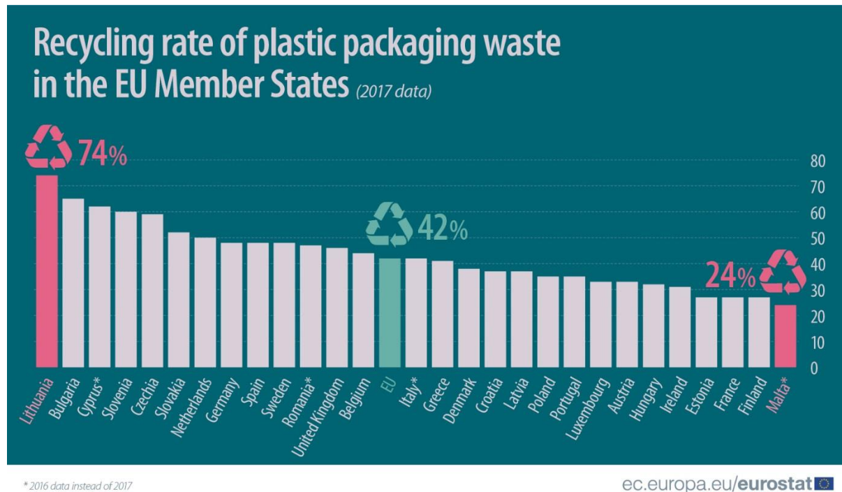
Figure 1 Official statistics for recycling of plastic packaging in the member states of EU.

Global recycling rates vary considerably but are typically below 40%, and the streams that are not recycled are most commonly landfilled or incinerated (most often with energy recovery in developed countries). The variation is illustrated in Figure 1 which present the situation on recycling of plastic packaging in the EU member states.