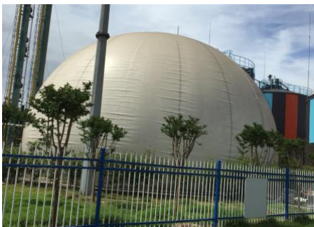
Figure 2. Main biogas process units