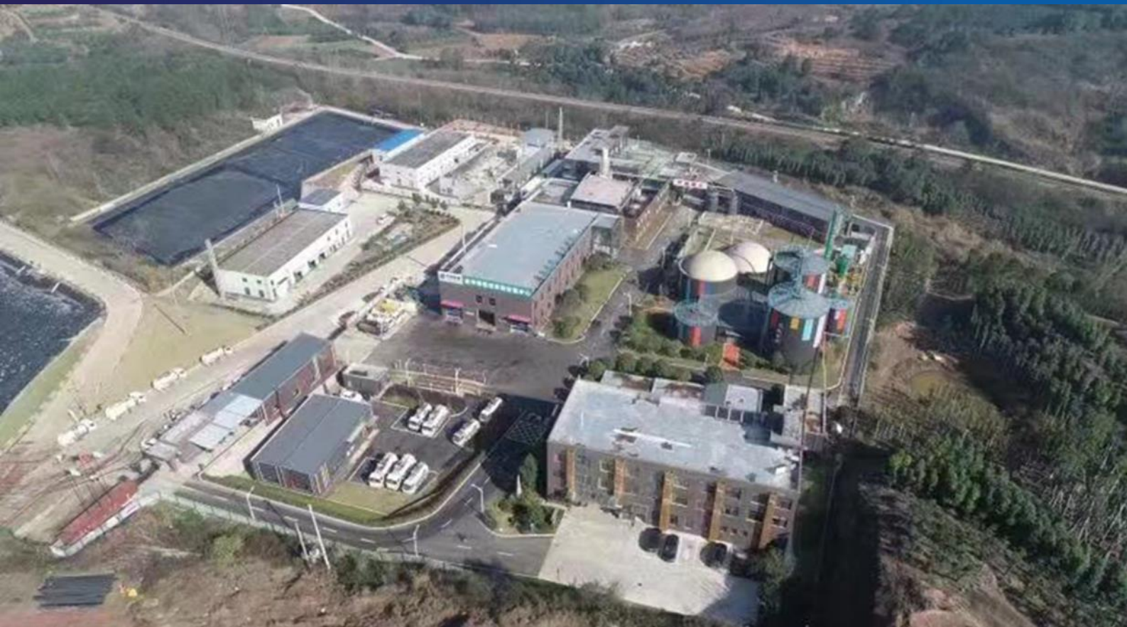
Figure 1. An overview of the Jinhua Kitchen Waste Biogas Plant