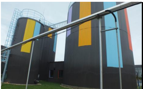
(A) Anaerobic digestion tank