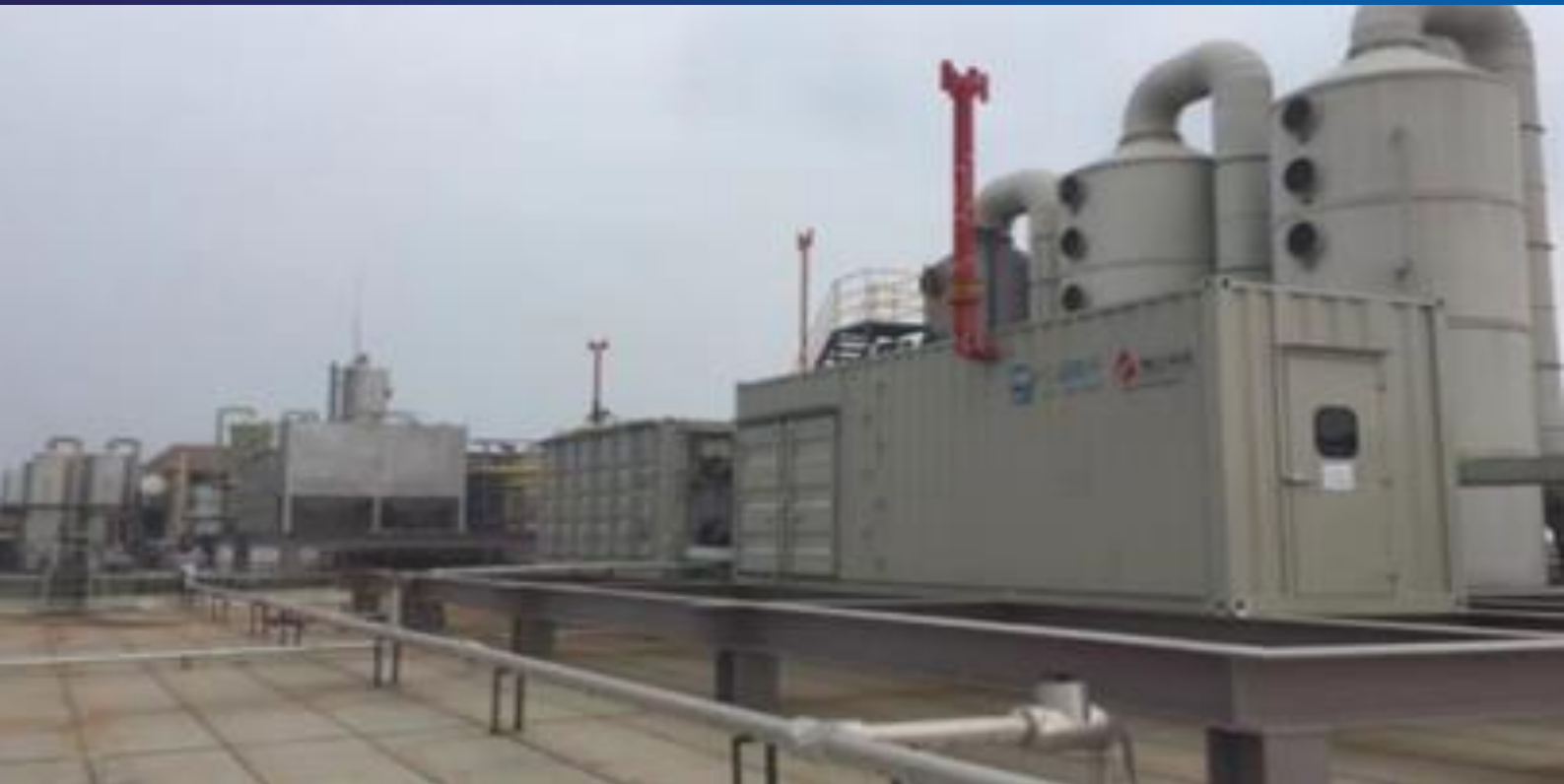
Figure 1: Biogas purification plant in Hangzhou Lily Group Co.,Ltd