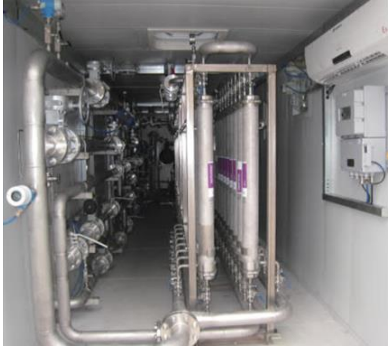
Figure 3: Membrane purification equipment